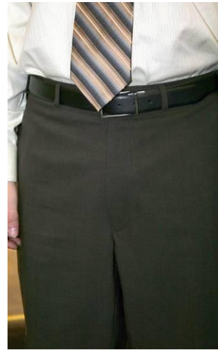
Flat front pants with hemmed bottom