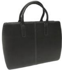
Black dress pump and matching portfolio