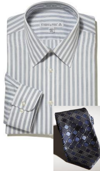
Blue stripe shirt and patterned tie