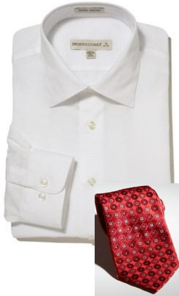
Solid white cotton shirt and red silk tie