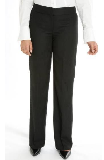
Pants with little or no break at the hem