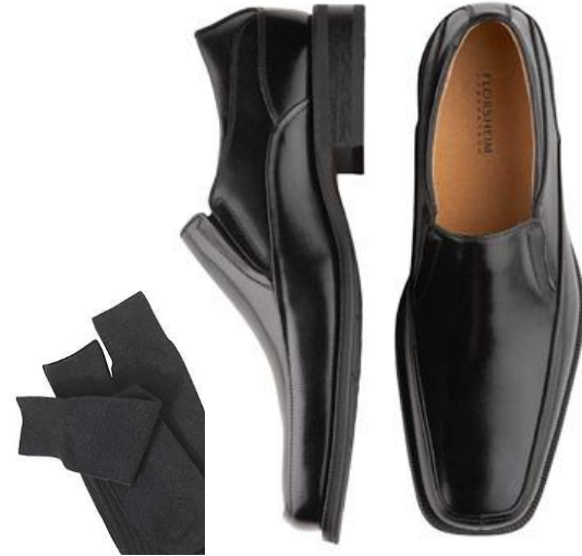
Black leather slip-on and charcoal gray socks