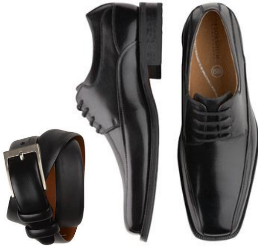
Black leather lace-up, bike-toe shoe and matching belt