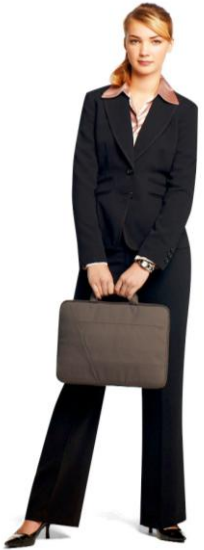
2-piece matching pant suit