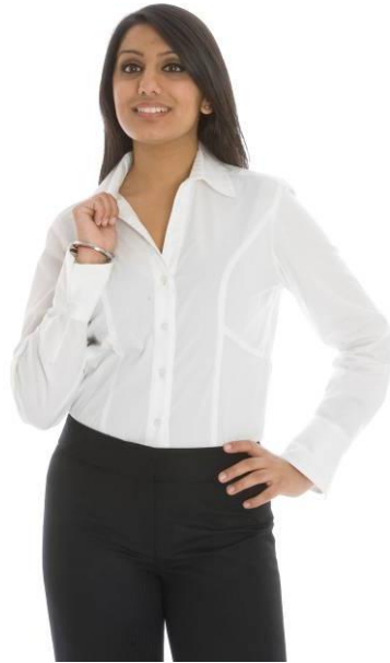
Collared white cotton blouse