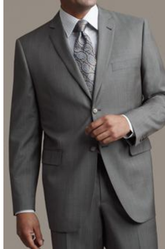
Modern fit, earth-tone suit with patterned shirt and tie